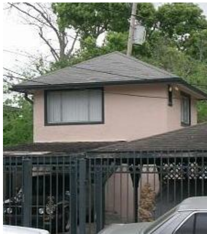
This is the garage behind 520 Branard as it looks today.