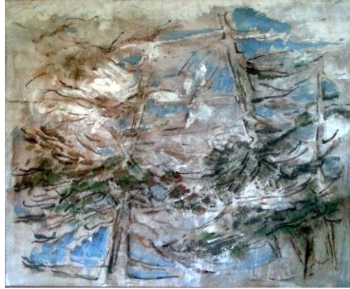
Gene Charlton [Cherries on Table], 1947, oil on canvas, 12 ½ x 15 ¾ inches (1); Charlton The Wind and the Trees , 1951, oil on Masonite, 20x24 inches