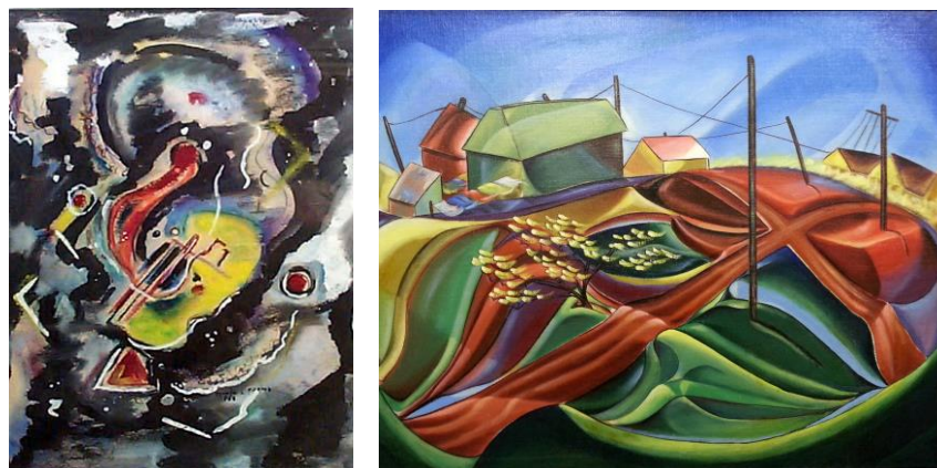
Maudee Carron Magic Script #1 1944 watercolor 8 ½ x 11 ¼ inches (l); Nione Carlson [Title Not Known] late 1930s oil on canvas on board 23 ½ x 29 inches (r)

Our Little Gallery, short lived and perhaps not broadly appreciated, was a small step but a significant one along the path that took the Houston art world from Magnolia City to Space City. For at least a little while in 1938, Houston, far away from the major art centers of the US and Europe, had a gallery of its own devoted to showing art made by artists of its own inspired by the most avant-garde works of the day. That, for Houston was certainly news!