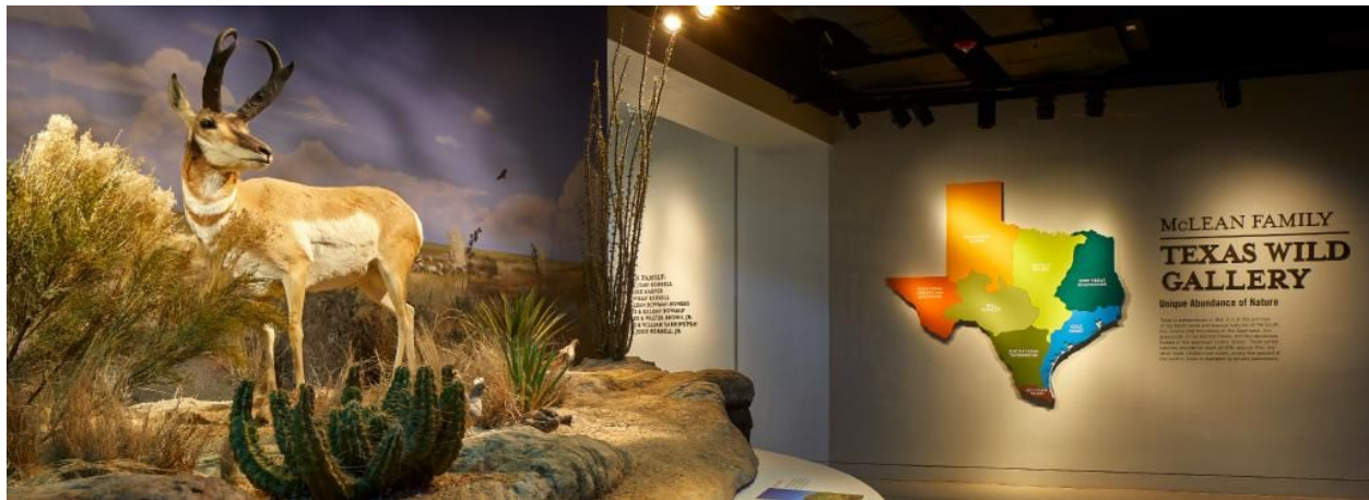
McLean Family Texas Wild Gallery

You can expand your experience in the Dinosaur Lab, where they can excavate dinosaur bones and experience how paleontologists study fossils. Compare the jaws and teeth of meat eaters with those of plant eaters. Learn what ancient footprints can tell us about dinosaur behavior.