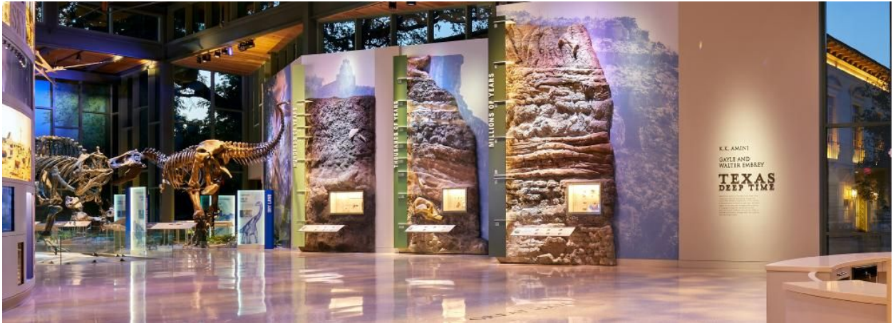
H-E-B Lantern Valero Great Hall Orientation Gallery

https://www.wittemuseum.org/h-e-b-lanternvalero-great-hallorientation-gallery/