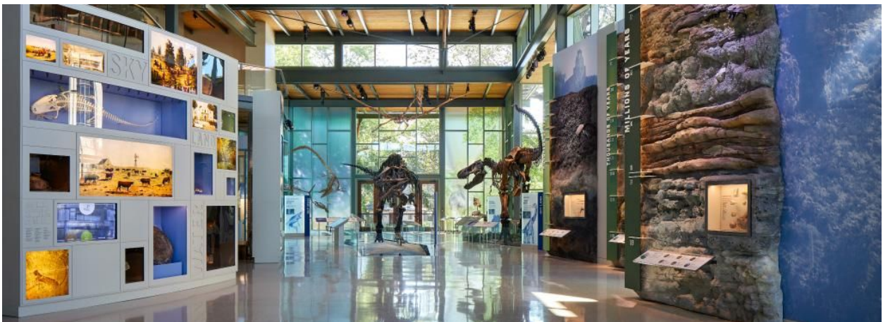
Naylor Family Dinosaur Gallery

A replica of a giant Quetzalcoatlus will greet you as you enter the H-E-B Lantern. Next, it's onto the Valero Great Hall to explore the K.K. Amini and Walter and Gayle Embrey Texas Deep Time Walls to see the changing landscape of what is now Texas. Discover a geological narrative preserved in vertical layers of rock and soil: millions, thousands and hundreds of years ago. Here you will be immersed into the land that is now Texas, both through time and geology. Fly over the landscapes of Texas in the Gates Mineral Company Orientation Gallery and prepare for a fascinating visit through Texas Deep Time. Your path to discovery begins here!